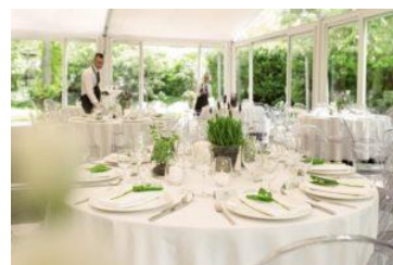
ul. Foksal 3/5

“Villa Foksal” restaurant (dress code – black tie)